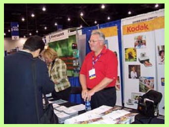
NMSCD Annual Conference & Expo (Las Vegas)