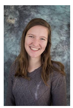
Jefferson City, Missouri