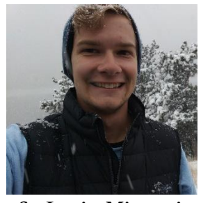
St. Louis, Missouri

Subjected various bacteria to different permutations of borate based glasses prepared by the materials engineering department. The glasses would cause bacterial termination and the causes of such termination were explored.