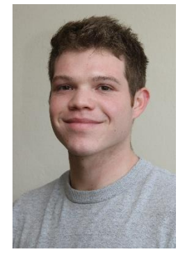
Lee's Summit, Missouri

This research project characterizes the texture, morphology, composition, mineralogy and geochemical of dune sediments from the Al-Jafr Basin, Jordan. The research consists of the first dune samples to be analyzed from the largest basin on the Jordan Plateau. Using various analytical methods reveal the paleoenvironmental processes dominating landscape formation at this location. Microscope examination revealed presence of vegetation and fossils. Grain size results throughout the sand dune samples identified the sediment as predominately silt size particles, predominately fine silt. This indicates moderate and steady wind energy to transport these particles.