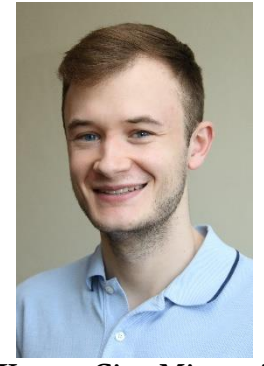
Kansas City, Missouri

Participants who were rejected by their partner chose to eat healthy and unhealthy foods less. Per the literature surrounding stress research, rejected participants were expected to eat more unhealthy foods; however, they demonstrated restricted eating behaviors after stress exposure. It was likely that the nature of the stress in this experiment, the stress stemming from the social rejection by first impression, might have guided the individuals to turn their attention inward, causing them to self-consciously restrict their eating.