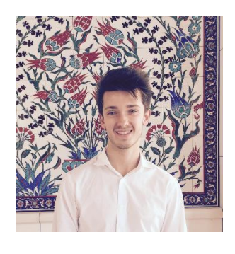
St. Charles, Missouri

We apply our ARA methodology in a real-world mobile cloud computing application, Panacea's Cloud, using experiments and simulations to show how we streamline information flows for disaster response coordination. ARA is shown to be an effective framework for improving disaster management outcomes during a pilot test with Task Force Once, Missouri's leading disaster response team. Specifically, ARA is shown to decrease disaster response time by nearly fifty percent compared with current response practices.