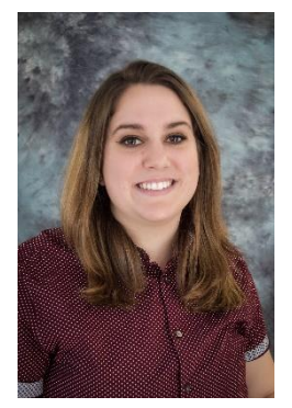
Santa Cruz, California residing in Columbia, Missouri