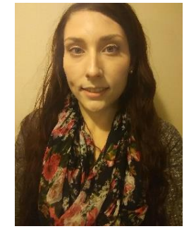
St. Peters, Missouri

Arabidopsis thaliana, like many plants, have seeds that contain fatty acids. This is the main source of nutrients for the plant before photosynthesis occurs. The fatty acid that I'm interested in is a trans-fat; trans-fats contain double bonds which make them difficult to metabolize. The enzymes involved in the two pathways that break down these double bonds are also involved in other important processes. Like humans, plants contain hormones that help them grow. The conversion of the hormone IAA to IBA helps the seedling grow strong lateral roots. It is important to note that not all plants respond to this hormone. The two pathways that a trans-fat can undergo in order to lose its double bond are the hydratase pathway and the reductase pathway. Mutated enzymes in the hydratase pathway, shown in prior research, interrupt the conversion of IAA to IBA. This causes the seedling to have smaller leaves and thinner, long roots. However, the importance of the reductase pathway and its relation to IAA/IBA is yet to be discovered. By disrupting enzyme activity in the reductase pathway, I will be able to characterize the function of this pathway and gain insight on how plants convert IAA to IBA. This information can be applied to plants that do not normally respond to IBA, potentially providing alternative ways to produce larger plants and crops.