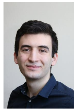
Ankara, Turkey residing in Kansas City, Missouri

How does education level impact a person's perception of corruption within their state? In this study, we draw on cross-national and cross-temporal survey data of 30 European states which was produced by the Inter-University Consortium for Political and Social Research (ICPSR) and Leibniz Institute for the Social Sciences (GESIS). We examine the relationship between education levels and perceived corruption in 24,276 responses. We find that there is a statistically significant negative relationship between a respondent's level of education and the corruption that they perceive in their state. Moreover, we found that there is no significant effect of education on perceived political corruption.