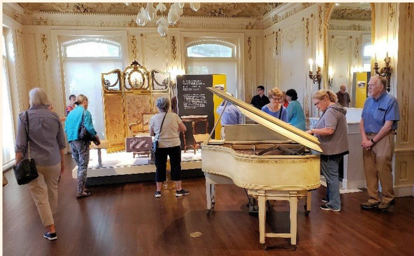
UMKCRA members tour Kansas City Museum Corinthian Hall.

In addition to the history it illuminates, the museum is a beautiful venue, with period artifacts and wonderful stained-glass windows.