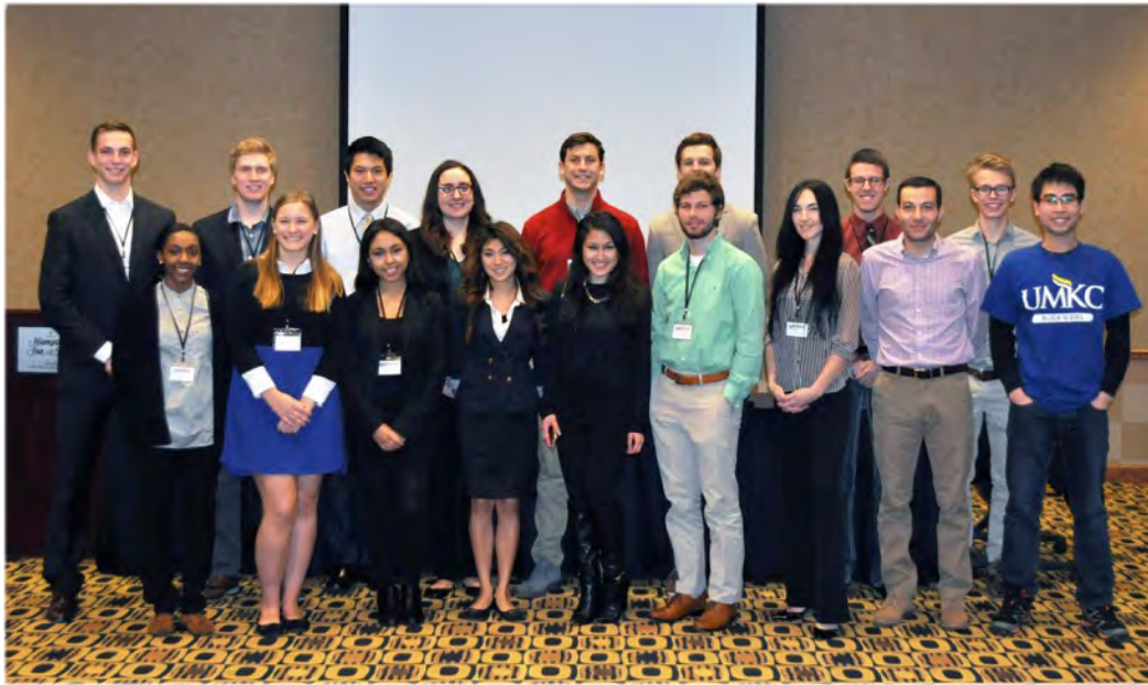
Members of the 2016 ESIP Cohort