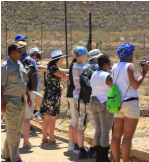
Aquila Game Reserve