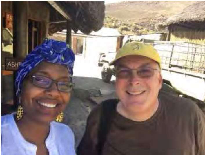
Aquila Game Reserve