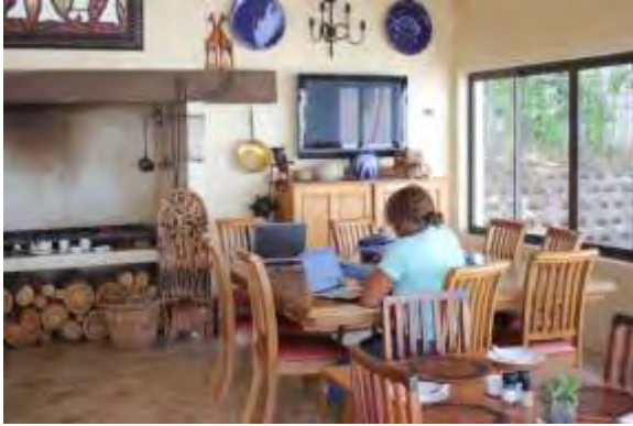
Working away on a beautiful day outside