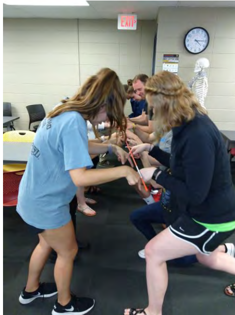
(Student Advisory Committee doing an Ice-Breaker Activity)