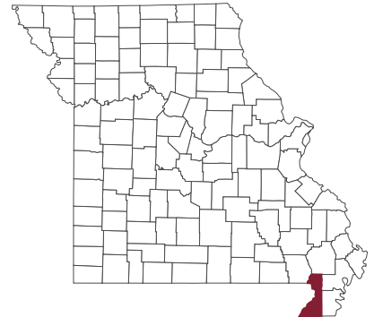
County population: 30,027

Rhodes Farm (Delta Center) MU Extension in: Dunklin County