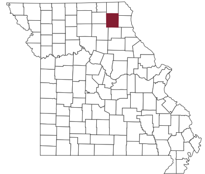
County population: 3,947

Greenley Memorial MU Extension in: Knox County