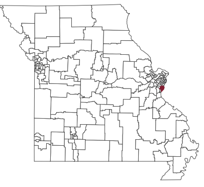
District population: 35,779

• $23,003 remitted to 2 district vendors, for 3 projects