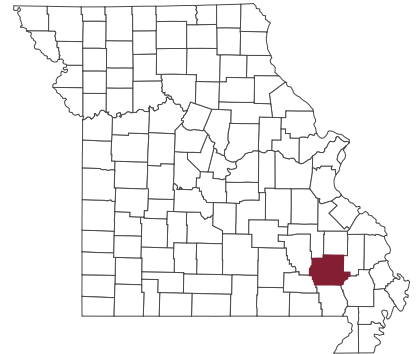
County population: 13,195