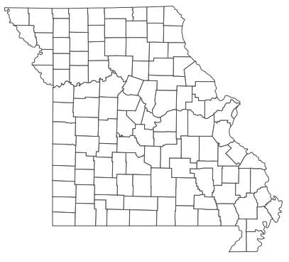
Missouri population: 6,075,300 Total FY2019 UM students: 82,142 Total UM Pell grant recipients: 13,188

Baskett Wildlife Area, Bertha Brown Farm, Bradford Farm, Cavanaugh Farm (Delta Center), Delta Center (Marsh/Bay Farm), Ellis Fischel Cancer Research Center, Forage Systems Research Center, Foremost Dairy, Foremost Dairy - Kirby Tract (Leased), Graves Farm and 30 more