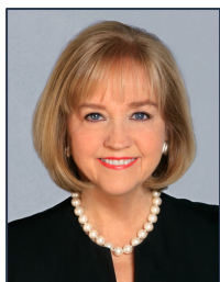
Lyda Krewson District 1 St. Louis Term expires Jan. 1, 2027