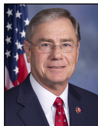
Blaine Luetkemeyer At-large Member St. Elizabeth Term expires Jan. 1, 2031