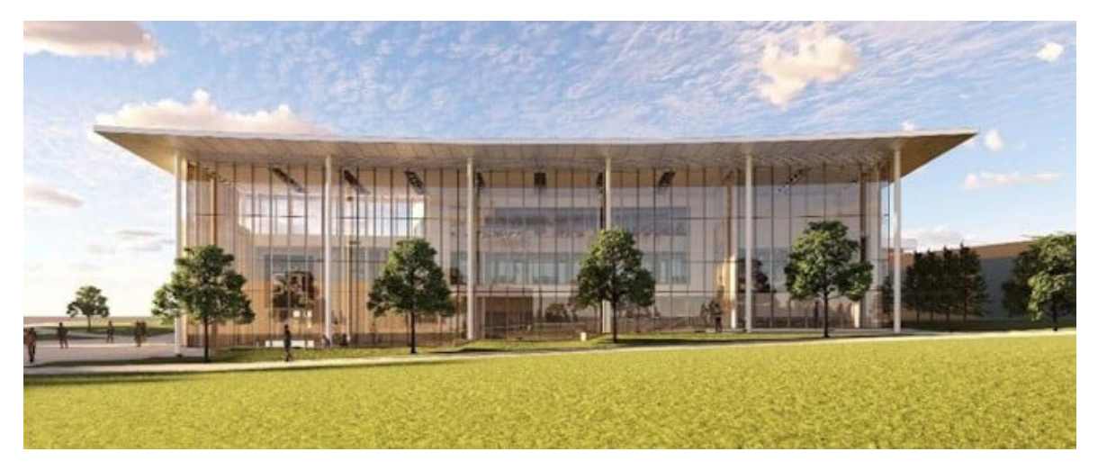
S&T Welcome Center from the South Lawn