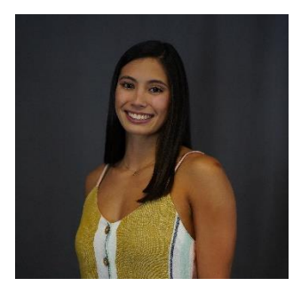
St. Louis, Missouri