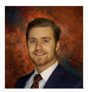
St. Louis, Missouri