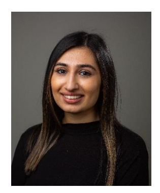
Bronx, New York residing in Lees Summit, MO

This study focuses on observing and analyzing the different behavioral patterns Dubia cockroaches use to avoid potential predation. Blaptica dubia (Dubia cockroaches) are natively found in South America in tropical locations. There is considerable variation in terms of habitats occupied by insect groups and how they avoid detection by predators in those locations including camouflage or taking cover. Documented strategies include burying themselves in the substrate and otherwise hiding in tight spaces. This species has been shown to favor hiding in crevices and hollow spaces to avoid being detected. Additionally, Dubia cockroaches discriminated between colored-shelter options. Dubia cockroaches are economically beneficial because of their recently gained importance to the reptile food industry due to their high protein and Calcium content. Because of the close phylogenetic relationship between the Dubia cockroach (one of the most preferred feeder insect options available in Missouri) and the German cockroach (which is the most abundant domestic pest cockroach in Missouri) it may be possible to extend the reach of this study to find ways to dissuade domestic infestations of this widespread household pest. Using the German roach as a model in the experimental design poses limitations. Thus, this study aims to understand how avoidance observed in Dubia roaches can be a model for the common household roach.