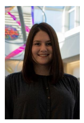
Ste. Genevieve, Missouri

We injected 40-60 mice with either a control antibody, which does not turn off a protein, or a combination of myostatin and activin-A antibodies, which bind to those specific proteins and turn off their function. Mice treated with the combination treatment showed an increase in lean muscle mass and body weights, as well as a decrease in body fat. The decrease in fat is a typical correlation with an increase in muscle, indicating the success of additional muscle growth. Further testing will need to be completed to determine the effect on bones, but it is expected that this increase in muscle as well as the lack of function in the activin-A protein will lead to stronger bones.