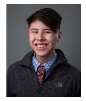
Kansas City, Missouri

The expense of traditional water quality monitoring systems has limited community accessibility, giving rise to public health concerns of harmful algal blooms. Availability of reliable, affordable, and realtime water quality data is not an option for most communities due to technical and financial limitation. The purpose of this project is to develop a cost-effective approach to monitoring the water quality of lakes in real-time. I developed an IoTbased (internet of things) water quality sensor system and deployed on Smithville Lake in Missouri. This device provides the water quality information based on specific parameters known to be linked to increased health risk, enabling local governments to act accordingly. The device was deployed alongside a United States Environmental Protection Agency water quality probe for verification of data accuracy. Further research is needed to improve the device, but the results of this study show potential for the development of an affordable and accurate water quality monitoring system.