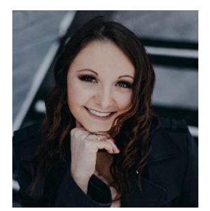
Carlyle, IL residing in St. Louis, MO