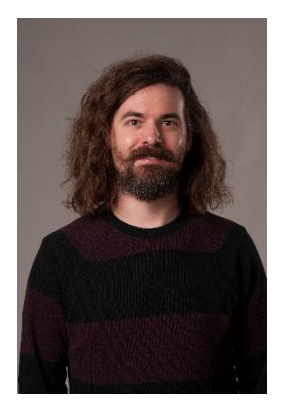
Kansas City, Kansas residing in Kansas City, MO