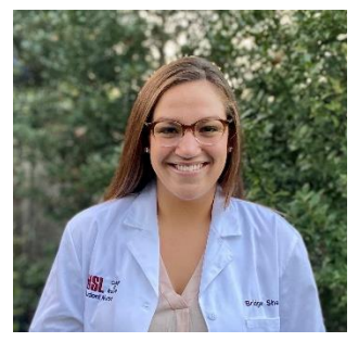
St. Louis, Missouri

Therefore, there's an imperative need to educate students, coaches, and athletic trainers on preventative measures, signs and symptoms and care of concussion. An interprofessional concussion management model is necessary to successfully manage concussion including prevention and follow-up care.