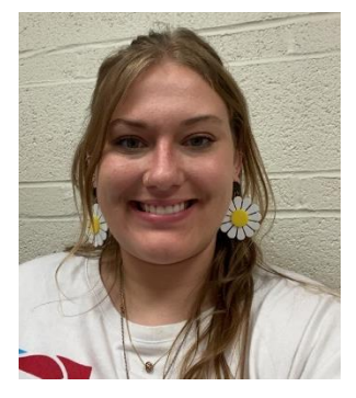
St. Louis Missouri