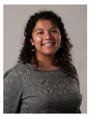
Kansas City, Kansas residing in Kansas City, MO