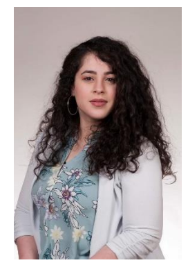
Kansas City, Missouri

Doxorubicin is a cancer drug that treats a wide range of cancers namely leukemia, lymphoma, and cancers in internal organs, tissues, and skins. This drug damages the cancerous cells and prevents them from growing and reproducing. Previous studies found that when the doxorubicin is intercalated, the DNA of the cancer cell forms a complex preventing the enzyme topoisomerase-II from performing its function of replicating the DNA, in this instance the DNA. However, cancerous blocking the topoisomerase-II enzyme results in the cancer cell to kill itself. It is important to note where this drug is added into the DNA. DNA has four base pairs that create an abundant number of sequences. Finding the most effective base pair, for the cancer drug to be inserted, can efficiently block the DNA replication and translation of the cancer cell. Consequently, this can guide in finding the strongest topoisomerase inhibitors to force the cancer cell to its end. Finding the best insertion site can more effectively prevent the spread of the cancer while also decreasing the side effects of the drug. This research project focuses on studying different DNA sequences that would generate the highest yield for the insertion of doxorubicin. This is determined by analyzing chemical and physical properties of the cancer drug incorporated into the various studied base pairs in the DNA. This understanding can guide the advancement and modification of drug designs intercalating into DNA sequences.